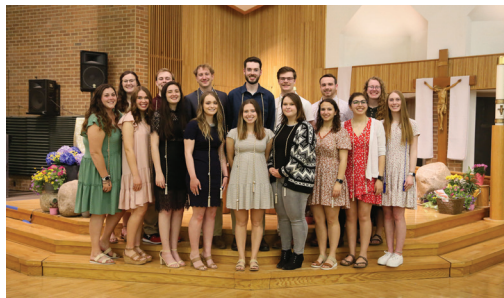
Baccalaureate Mass May 5, 2022