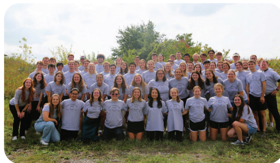
Iron Sharpens Iron, Fall 2023 Undergraduate Retreat