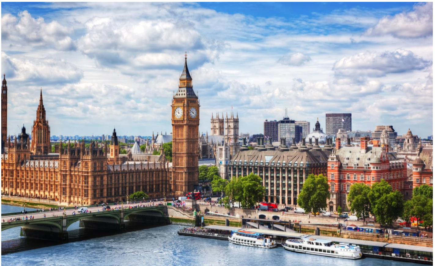
Big Ben – London

(Air/land tour price is only $2999 plus $700 government taxes/airline surcharges)