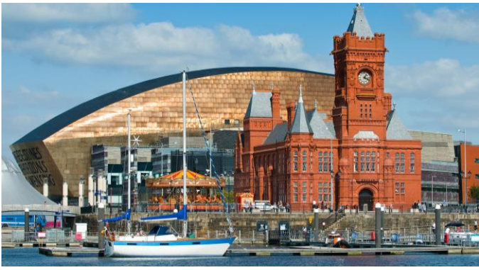
Port of Cardiff