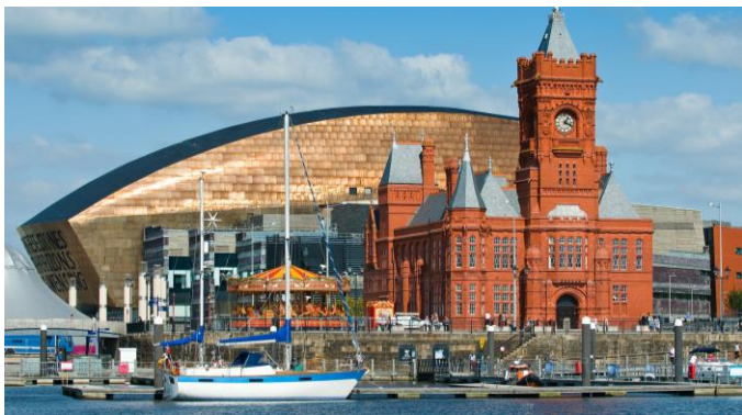
Port of Cardiff