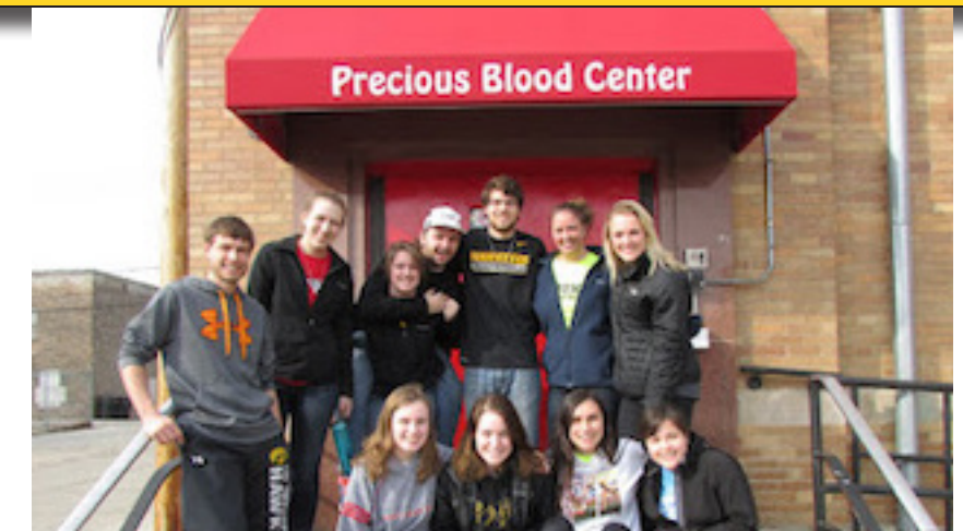
Pray, Serve, Learn Alternative Spring Break Trip March 17-22, 2019

Join us for a social justice and service experience in Chicago over spring break! More details inside the bulletin.