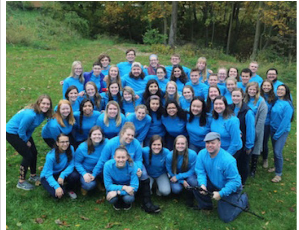
Spring Retreat- Livin' on a Prayer February 15-17th