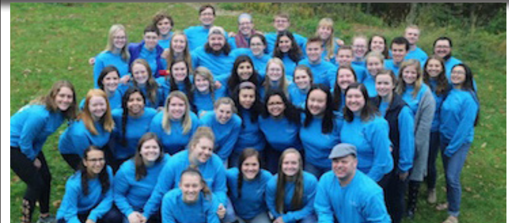
College students were Gone Fishing at our Fall Retreat held October 12-14 and for the Homecoming Parade this year on October 19. Join us as we continue our journey toward greater discipleship with Jesus this year.