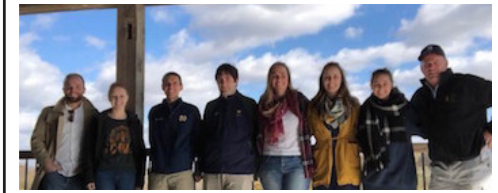
This fall college students have enjoyed many activities through the Newman Center that have helped them grow spiritually, socially, and in serving others. Pictured here are students serving at the Catholic Worker House on Saturday, October 27 and some of the Graduate Students and Young Professionals at Wilson’s Orchard last Sunday, October 28.