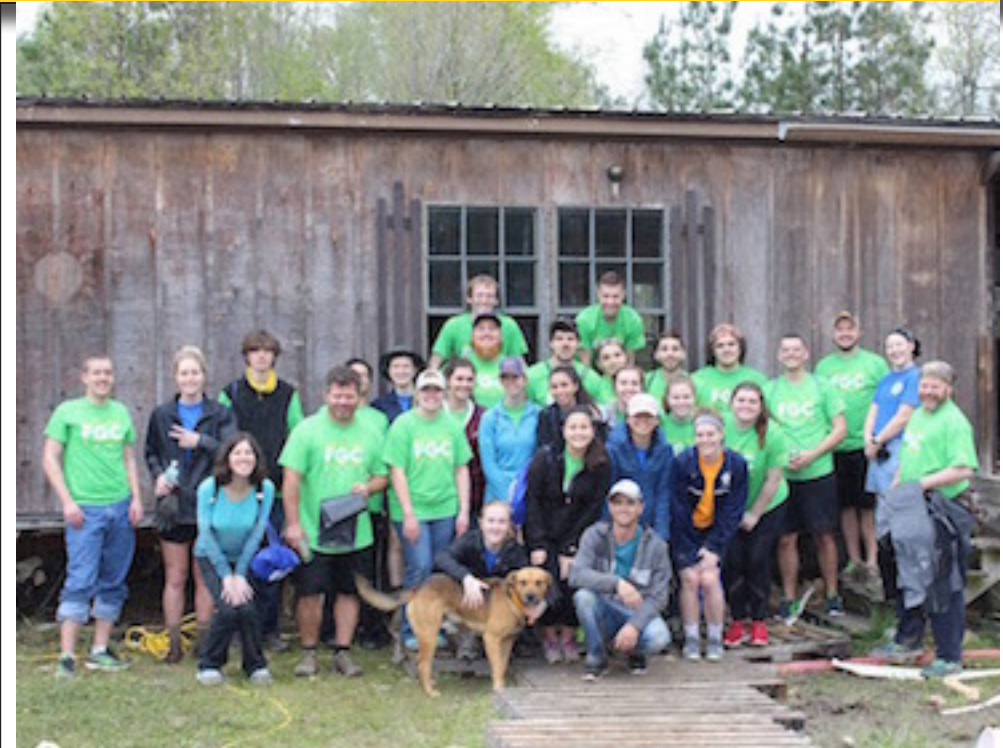
Alternative Spring Break Trip March 17-22, 2019 Chicago, IL

Join us on an Urban Immersion Retreat for service and social justice. More details inside the bulletin!